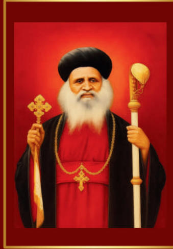
SAINT PAULOSE MAR ATHANASIOUS